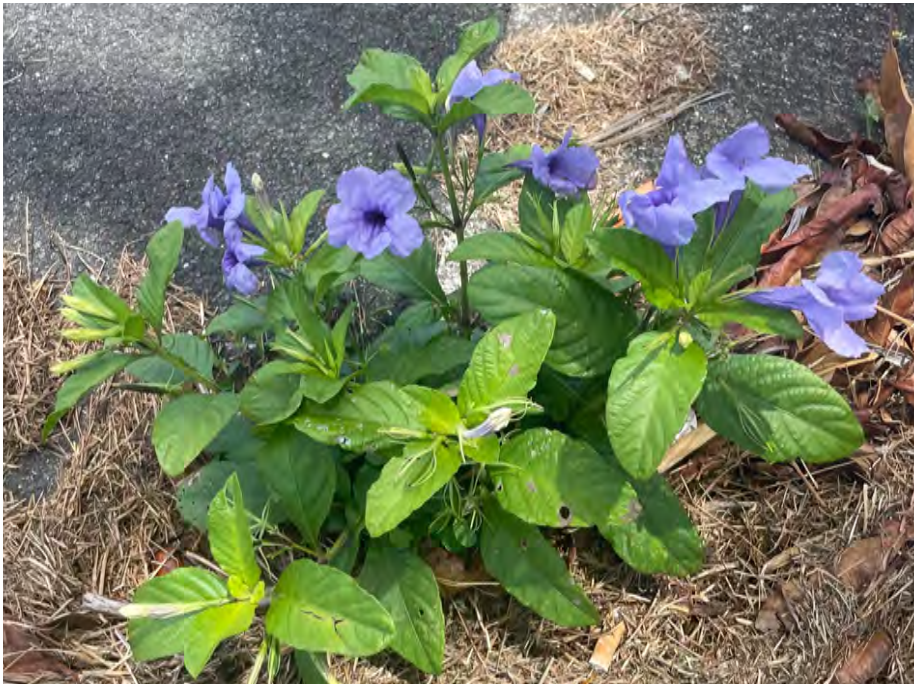
Ruellia tuberosa along roadside