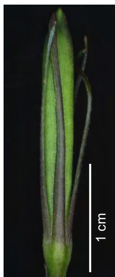
Young fruit with filiform calyx