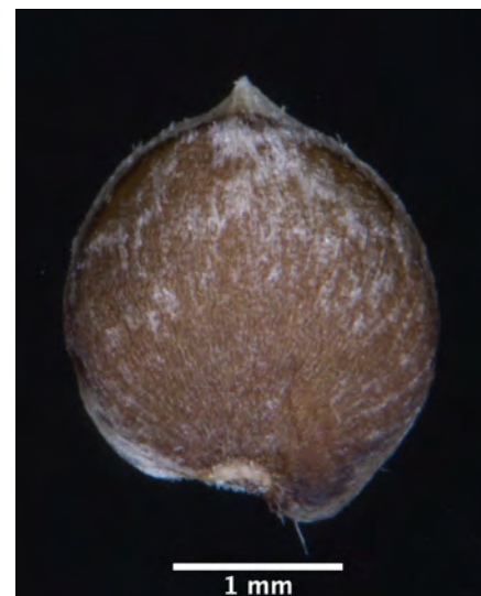
Close-up of seed