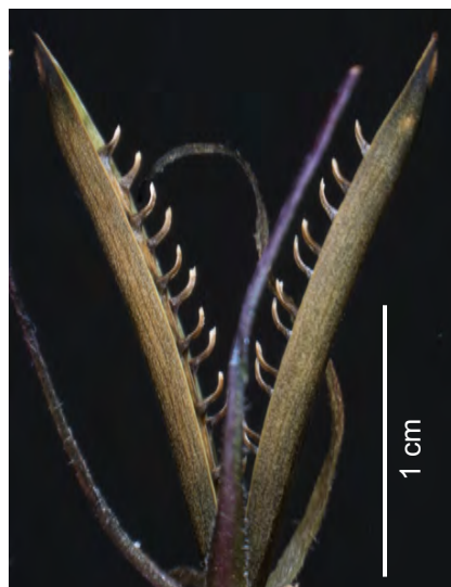
Open seed capsule