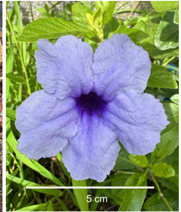
Corolla tube with a darkened center