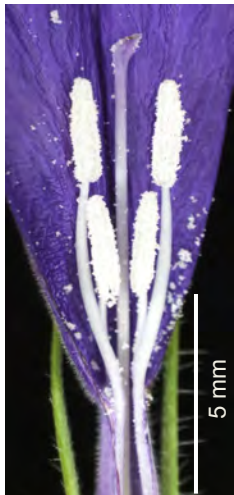
Didynamous stamens and style