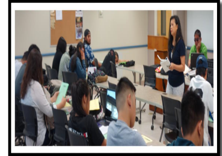
Course Scheduling Workshop