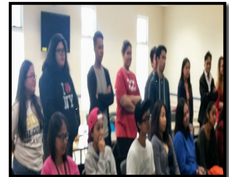
Reading & Writing Workshop