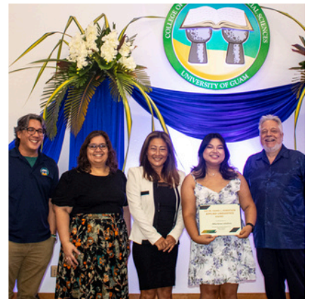
Daniel L. Robertson Linguistics Award