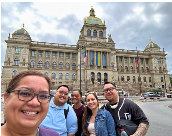
CHAMORU STUDIES, CLINICAL PSYCHOLOGY, & HISTORY - NEW ZEALAND STUDIES ASSOCIATION | PRAGUE, CZECH REPUBLIC