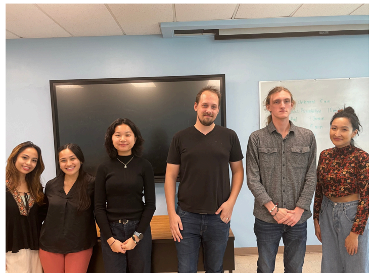
Presentations related to "Nietzsche and Overcoming Colonial Mentality on Guam"