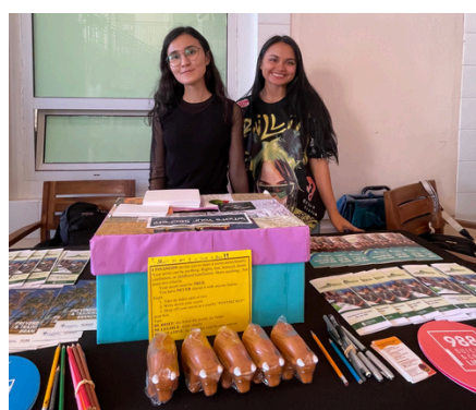
I Pinangon Suicide Prevention Program