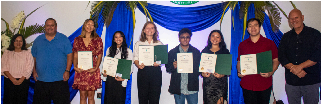
Alpha Kappa Delta - International Honor Society for Sociology - UOG Chapter