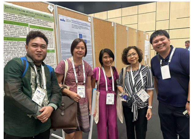
PSYCHOLOGY - 33RD INTERNATIONAL CONGRESS OF PSYCHOLOGY | PRAGUE, CZECH REPUBLIC