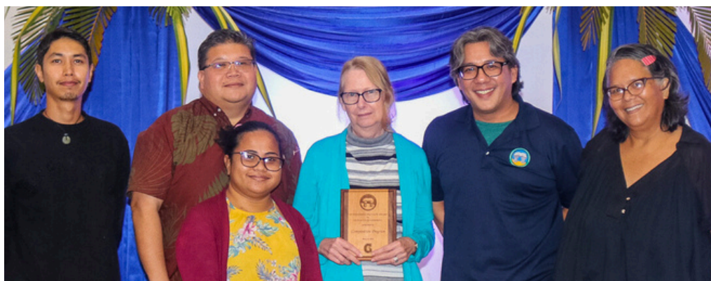
Excellence in Assessment Composition Program