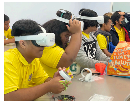
Virtual Reality with Marianas History Club & Pacific Historic Parks