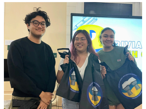
3RD PLACE: LALAS