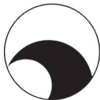
Isla Center for the Arts