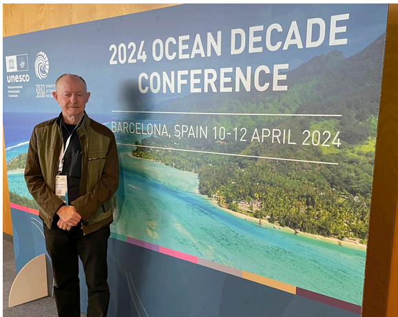
ANTHROPOLOGY - 2024 OCEAN DECADE CONFERENCE | BARCELONA, SPAIN