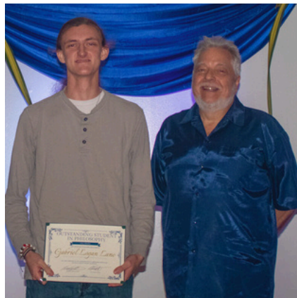
Outstanding Philosophy Student