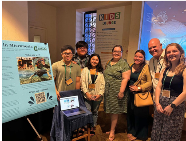
SOCIOLOGY - UOG CENTER FOR ISLAND SUSTAINABILITY CONFERENCE | GUAM