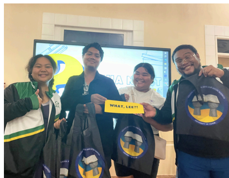
2ND PLACE: WHAT, LEE?!