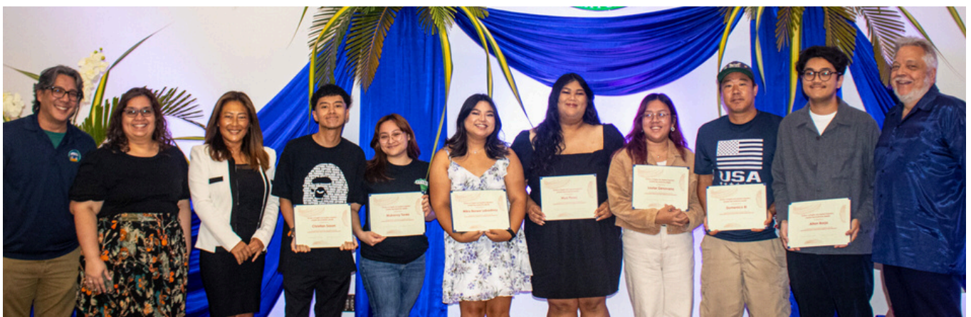
Student Organization Recognition Award: Linguistics & Language Appreciation Society (LALAS)