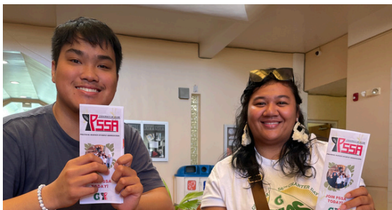
Political Science Student Association