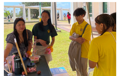
United Nations Association Relay