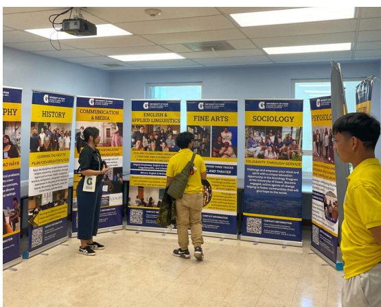
Meet the Programs Banner Gallery