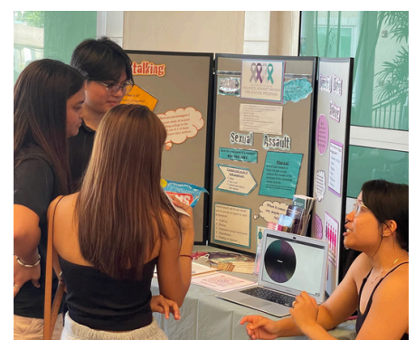
Violence Against Women Prevention Program