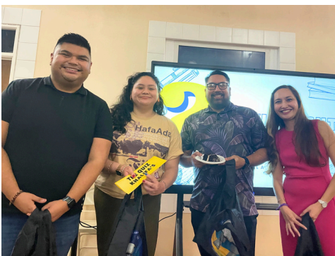
1ST PLACE: THE QUIZ KHALIFA'S