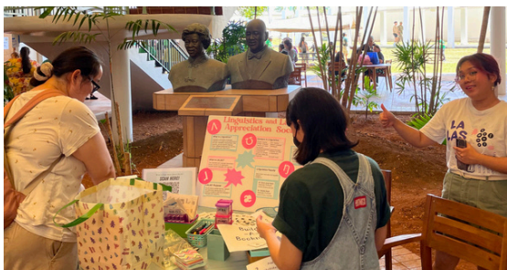
Linguistics & Language Appreciation Society

For the 56th University of Guam Charter Day, our college celebrated with our degree programs, student organizations, and community partners. Here are some photos highlighting the event (pages 11-12).