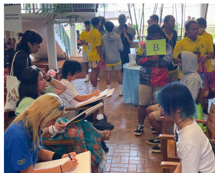
Caricatures with Visual Art Students: Fine Arts Program