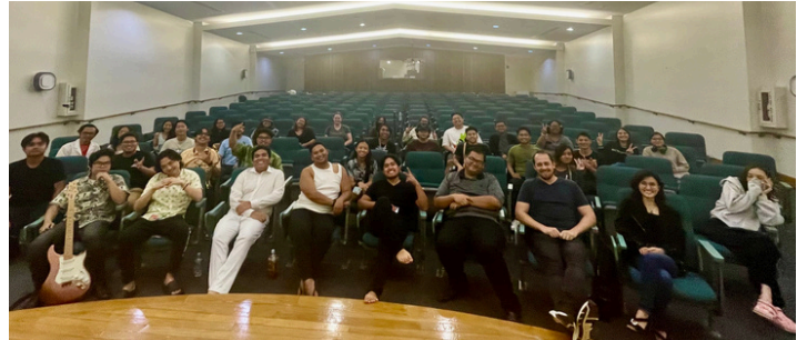
Presentations by Fine Arts majors and artists in music, theatre, and the visual arts.