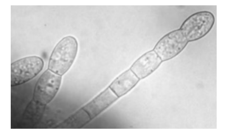
Figure 4. Conidia and conidiophores of a powdery mildew fungus