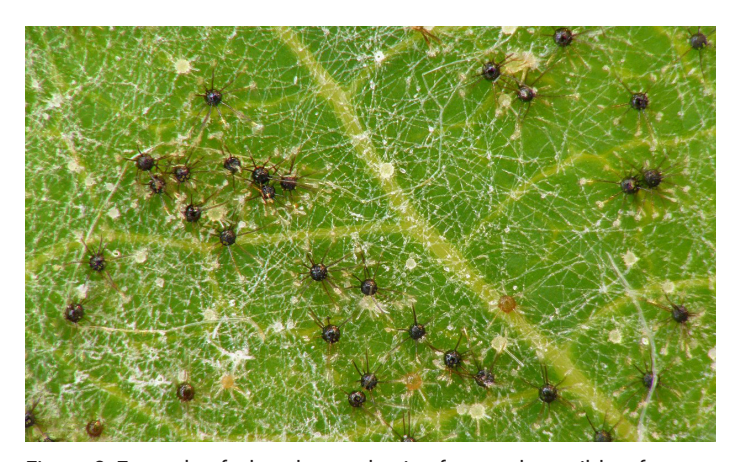
Figure 2. Example of what chasmothecia of a powdery mildew fungus look like under a 14X hand lens

After a spore lands on a leaf surface, it germinates and produces thin thread-like branching filaments called hyphae. En masse they form the mycelium, which comprise the vegetative (non-sporulating) body of the fungus. Some of the hyphae will develop into specialized cells called conidiophores (8-15 µm wide x 40-132 µm long) (Fig. 1, 3, &4). It is from these upright, simple conidiophores that chains of conidia (asexual spores) are produced (Fig. 1, Fig. 3). A single chain may consist of 3-5 spores. Conidia are large (16-29 µm wide x 32-46 µm long), ovoid, singlecelled, and clear (Fig. 4). Mycelium and conidiophores are produced mainly on the upper leaf surface, where en masse they can be easily seen as various sized patches of white powder. Over time these patches turn gravish and may become dotted with fruiting structures 80-150 µm in diameter. Chasmothecia are small, pinhead-sized, spherical structures that are initially white and later turn black with age (Fig. 2).