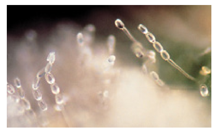
Figure 3. Conidiophores of a powdery mildew fungus with conidial chains