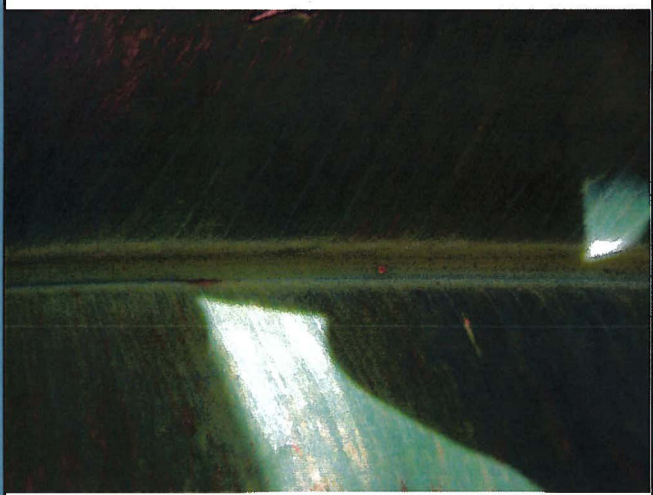
Dot-and-dash pattern on leaf infected with BBTV.

Banana plants can be infected for up to 4 before symptoms become months apparent. Symptoms of bunchy top disease include suckers that have numerous leaves bunched together instead of their normal growth habit. In healthy plants the stem grows some distance between leaves and the leaves don't look so crowded together. Infected plants also have yellow margins on the leaves. A closer examination reveals dark green streaks on the petioles, and the leaf lamina also exhibit a dot-and-dash pattern. Veins develop a hooked appearance where they connect to the midrib, as opposed to normal veins that are straight; this can be appreciated best by holding leaves up against the sun.