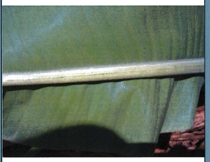
Dark streaks on midrib of BBTV infected leaf.