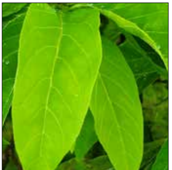
Figure 2. Sweetsop leaves