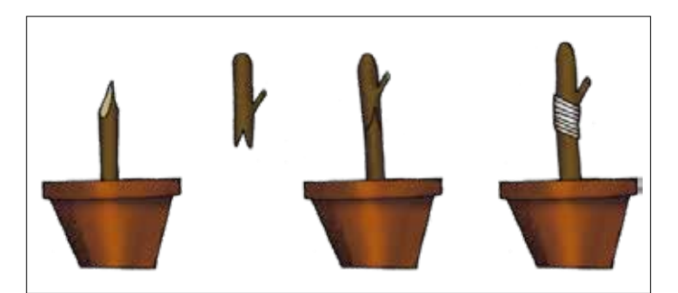
Figure 8. Wedge graft

Sweetsop generally can bloom year-round, although in Guam, the main flowering season is from January to June, which is generally the driest and coolest time of the year. It can take up to one to two months after flowering for fruit set and fruit development to begin. Depending on the variety, it takes three to four months for the fruit to mature after fruit set. Dry cool weather helps with good flower and fruit set and decreases the possibilities of fungal disease during fruit development.