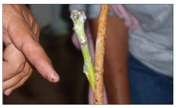
Figure 9. Side approach graft

The fruit yield of a sweetsop tree depends on its variety, spacing, the age of tree, soil fertility, and weather. In some parts of the world, sweetsop can produce up to 50 fruits/ tree. However, during a good year in Guam, each sweetsop tree bears an average of 20-30 fruits.