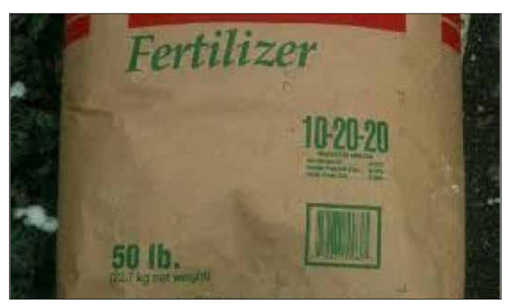
Figure 12 . A bag of a complete fertilizer

The application of fertilizer varies with the age of the tree and the type and condition of the soil. Young non-bearing and fruit-bearing trees require some type of complete fertilizer, such as 16-16-16, 10-20-20, or 10-30-10 on a regular basis. The numbers on the fertilizer bag represent the percentage of three primary elements: nitrogen (N),