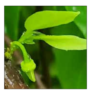
Figure 3. Newly emerged sweetsop flower