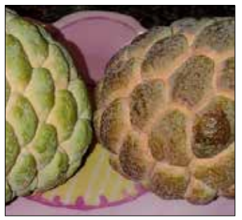
Figure 13. Harvested sweetsop fruit

mature fruit, place it on your kitchen counter-top or in a paper bag or box. The fruit will begin to soften and ripen in two to five days. The fruit should be eaten as soon as it softens. When ripe they may be stored in the refrigerator for two to four days before eating.