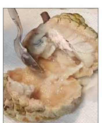
Figure 7. Mature sweetsop fruit with seeds

When mature, the fruit is soft with white, juicy segmented pieces of flesh that have a custard-like texture with a sweet, pleasant flavor. There are varieties that are seedless, but the more commonly grown sweetsop contains sometimes few or numerous hard brown or black bean-like seeds within the pieces of flesh (Fig. 7).