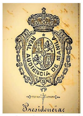
Seal and Letterhead Real Audiencia de Manila, 1886

Article 489 of the Law of Criminal Prosecution, each Court of First Instance ( Juzgado de Primera Instancia ) was required to have the assistance of a forensic medical examiner, whenever this was requested by the coroner.