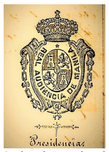
Seal and Letterhead Real Audiencia de Manila, 1886

Article 489 of the Law of Criminal Prosecution, each Court of First Instance ( Juzgado de Primera Instancia ) was required to have the assistance of a forensic medical examiner, whenever this was requested by the coroner.